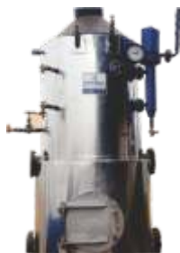
Vertical Hot Water Boiler (Range 100 to 1500 kg/hr.)