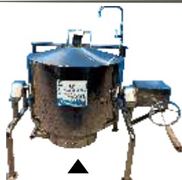
▲ S.S. 304 ENERGY SAVING GAS RICE/VEG. BOILER (RANGE 150 TO 450 LTRS.)