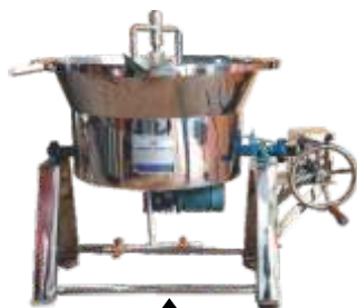
▲ S.S. 304 AUTOMATIC STEAM KHOYA/BURFI MACHINE Tilting (RANGE 120 LTRS. TO 400 LTRS.)