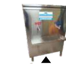
S.S. 304 WATER COOLER & HEATER