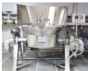
▲ S.S. 304 AUTOMATIC ROASTING Khoya/Burfi/Mawa Making T/F Tirling Kettle (RANGE 80 LTRS. TO 450 LTRS.)

OVER 10000+ INSTALLATIONS AND SUCESSFULLY WORKING PLANTS/MACHINERY ALL OVER INDIA, CANADA, USA, AUSTRALIA & AFRICA.