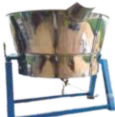
▲ S.S. 304 JAGGERY MAKING KETTLE