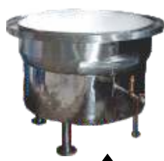
▲ S.S. 304 STEAM PETHA MAKING KETTLE (RANGE 150 LTR. TO 450 LTR.)