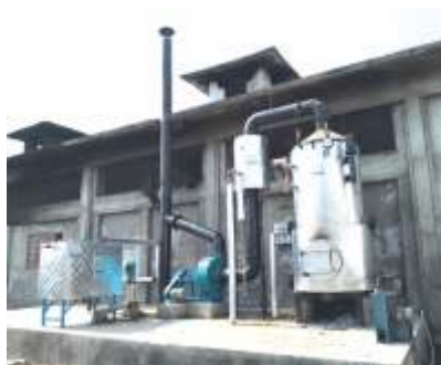
ECOPAC Wood Fired Hot Water Boiler Plant Range 100 Kg/hr to 1500 Kg/hr