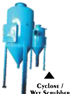
CYCLONE / WET SCRUBBER