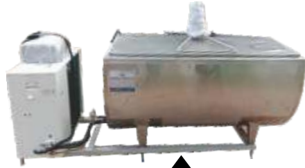
S.S. 304 Bulk Milk Cooler