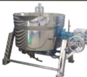
▲ S.S. 304 STEAM AGITATOR (RANGE 100 LTR. TO 1500 LTR.)