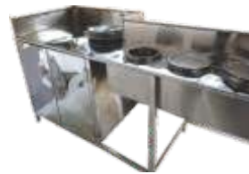
S.S. 304 HOT COUNTER/BAIN MARIE