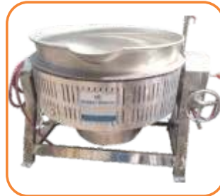
S.S. 304 ENERGY SAVING GAS COOKING KETTLE