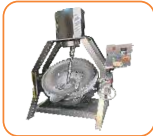
S.S. 304 ENERGY SAVING GAS PLANETARY AGITATOR