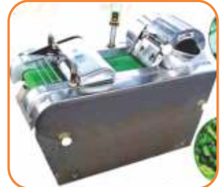
S.S. 304 VEGETABLE CUTTING MACHINE