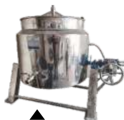
▲ S.S. 304 MILK AGITATOR (RANGE 100 TO 5000 LTRS.)