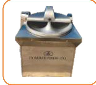
S.S. 304 VEG./MEAT BOWL CHOPPER