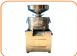
S.S. 304 CASHEW//RICE/DAL GRINDER MACHINE