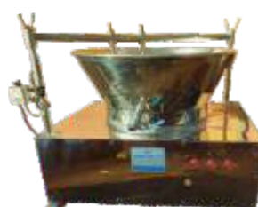
▲ AUTOMATIC S.S GAS FIRED KHOYA / MAWA MACHINE (RANGE 120 LTR. TO 400 LTR.)