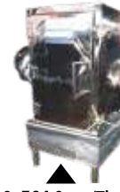
S.S. 304 STEAM/THERMIC BOILER Idli/Dhokla Machine