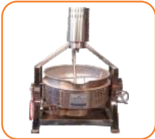
S.S. 304 ENERGY SAVING GAS AGITATOR