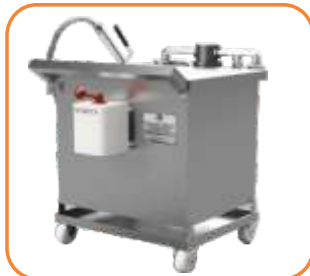
S.S. 304 REFINED / COOKING OIL FILTRATION MACHINE