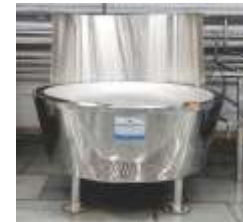
▲ S.S 304 STEAM/THERMIC FLUID KETTLE RASGULLA/GULAB JAMUN/CHASNI/KHOYA/BURFI (RANGE 100 LTR. TO 350 LTR.)