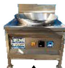
▲ S.S. 304 INDUCTION KETTLE / KADHAI (RANGE 12 TO 120 LTRS.)