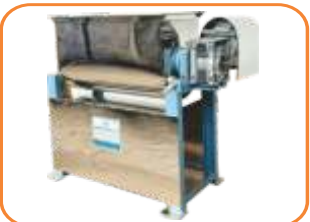
S.S. 304 DOUGH KNEADING MACHINE (RANGE 20 TO 500 KG.)