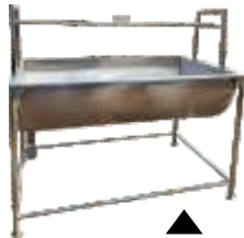
S.S. 304 Dish Washing Sink