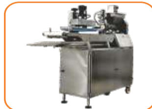
S.S. 304 RASGULLA BALL MACHINE