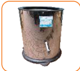
S.S. 304 OIL DRYING MACHINE