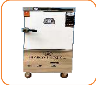
S.S. ENERGY SAVING GAS STEAMER