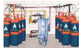
LPG LOT SYSTEM