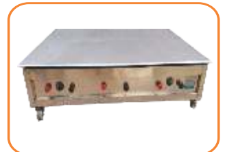
S.S. 304 GAS ROTI TAWA