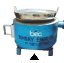
WOOD FIRED BHATTI + S.S. 304 Kadhai