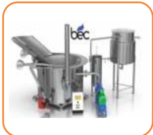
S.S. 304 CIRCULAR BATCH FRYER