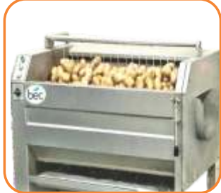
S.S. 304 POTATO/VEGETABLE PEELING AND WASHING MACHINE