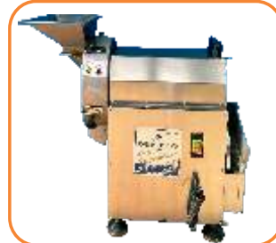
S.S. 304 AUTOMATIC ROOT CUTTING DICING/DICING/SHREDDING VEG. MACHINE