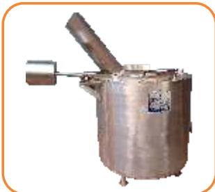
S.S. 304 AUTOMATIC SIMPLE BATCH FRYER