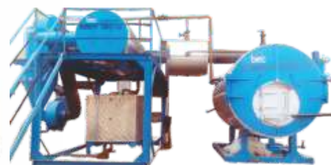
ECOPAC Wood fired 3 Pass Horizontal Hot Water Boiler