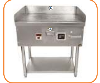
S.S. 304 INDUCTION DOSA TAWA