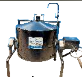
▲ S.S. 304 STEAM RICE/VEG. BOILER (RANGE 150 TO 450 LTRS.)