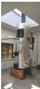
WATERPAC Wood Fired Hot Water Vertical Boiler Boiler Range : 100 Kg/hr to 1500 Kg/hr