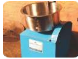
BESAN MALLI MACHINE