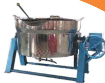
▲ Cooking S.S. 304 STEAM KETTLE RANGE 100 TO 1500 LTRS.

OVER 10000+ INSTALLATIONS AND SUCESSFULLY WORKING PLANTS/MACHINERY ALL OVER INDIA, CANADA, USA, AUSTRALIA & AFRICA.