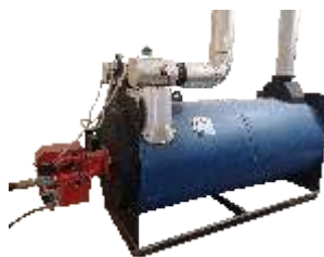
Gas Fired Thermic Fluid Boiler (Range 2 Lac Kcal/hr. to 25 Lac Kcal/hr.)