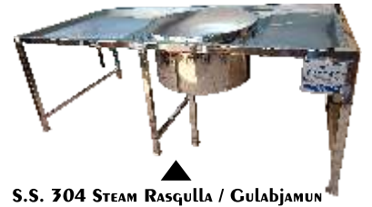
S.S. 304 STEAM Rasgulla / Gulabjamun Filling Table