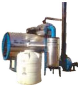
Wood Fired 3 Pass Horizontal Hot Water Boiler (Range 100 to 1500 kg/hr.)