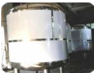
S.S. 304 MILK TANK