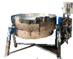
▲ S.S. 304 THERMIC FLUID COOKING KETTLE with ELECTRONIC TILTING (RANGE 200 TO 600 LTRS.)