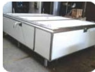
S.S. 304 PANEER-CHEESE TANK