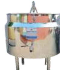
▲ S.S. 304 STEAM / T.F. MILK BOILER (RANGE 100 LTR. TO 5000 LTR.)