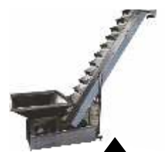
S.S. 304 Bucket Elevator