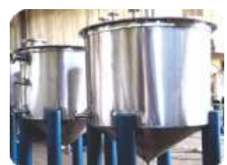
S.S. LIME STORAGE CONE BOTOM-TANK