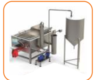
S.S. 304 RECTANGULAR BATCH FRYER GAS/DIESEL FIRED