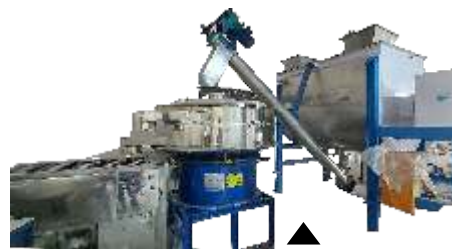
S.S. 304 VIBRATING SIEVE MACHINE & S.S. 304 JACKETED RIBBON BLENDER