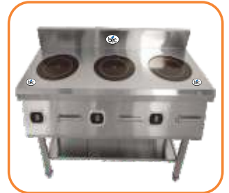
S.S. 304 THREE BURNER INDUCTION COOKTOP