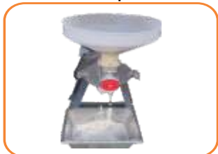
S.S. 304 CASHEW GRINDER MACHINE