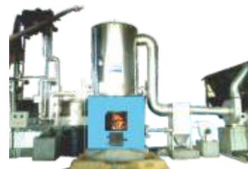
Wood Fired Thermic Fluid Boiler (Range 2 Lac Kcal/hr. to 25 Lac Kcal/hr.)