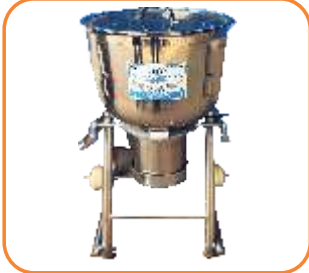
S.S. 304 TILTING BLENDER FOR CHUTNEY / GRAVY / PUREE