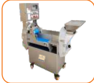
S.S. 304 AUTOMATIC VEG. CUTTING MACHINE LEAFY & ROOT VEG.