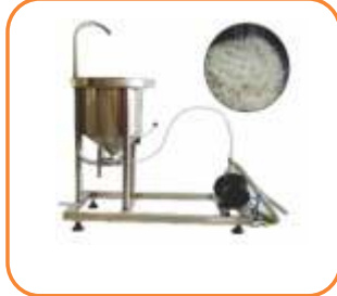
S.S. 304 RICE WASHER