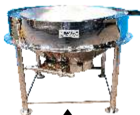
▲ S.S. 304 ENERGY SAVING GAS GULAB JAMUN / NAMKEEN FRYING KETTLE (RANGE 70 TO 150 LTRS.)