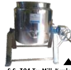
▲ S.S. 304 TEA MILK KETTLE (RANGE 50 LTR. TO 2000 LTR.)