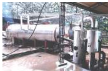
WASTE TO ENERGY M.S. HOT WATER TANK (RANGE 5kl TO 50 kl)