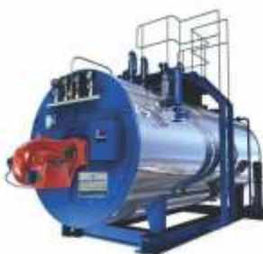
Hot Water Boiler Gas & Diesel Fired (Range 100 to 1500 kg/hr.)