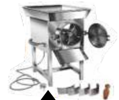
S.S. 304 GRAVY-MACHINE