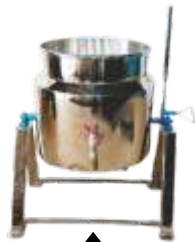
▲ S.S. 304 STEAM TEA / MILK KETTLE (RANGE 50 LTR. TO 1000 LTR.)