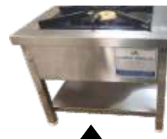
S.S. 304 SINGLE GAS BURNER