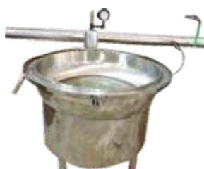
▲ S.S. 304 STEAM KHOYA & SWEET MAKING KETTLE