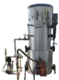
Gas Fired Vertical Hot Water Boiler (Range 100 to 1500 kg/hr.)