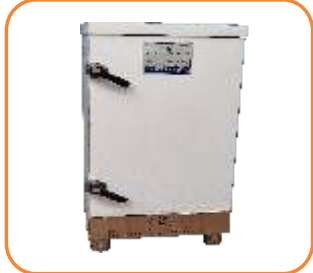
S.S. ENERGY SAVING ELECTRICAL STEAMER