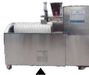
S.S. 304 Ladoo Ball Making Machine