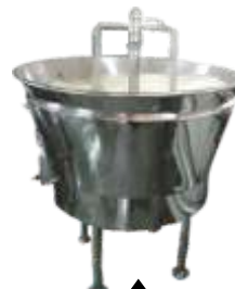
▲ S.S. 304 AUTOMATIC STEAM KHOYA/BURFI MACHINE (RANGE 120 LTR. TO 400 LTR.)