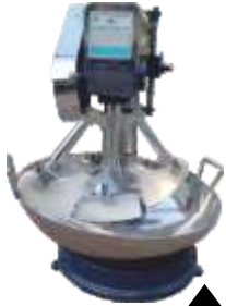
S.S. 304 Kaju Musti Machine