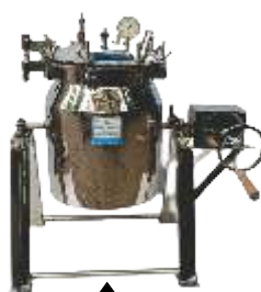
▲ S.S. 304 STEAM PRESSURE COOKER (RANGE 75 LTR. TO 500 LTR.)