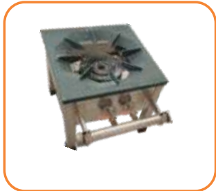
ENERGY SAVING 2 / 3 RING GAS BURNERS

Since 18 years Manufacturing Plants for Modernized Sweets (Mithai) Industry, Namkeen & Indian Snacks, Processing Units, Dairy Units, Food Processing Plants & Other Industries.