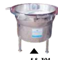
▲ S.S. 304 CHASNI / RASGULLA KETTLE