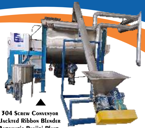
S.S. 304 SCREW CONVEYOR with Jacketed Ribbon Blender for AUTOMATIC Panjiri Plant

Steam Boilers with Steam Cooking Kettles & Food Cooking System for Halwai, Gurdwara Sahib, Mandir Boarding School & College. Thermic Fluid Boiler, Solar Power & Thermal Plants, Heat Exchanger, Over Dryers, Chemical Tanks, Expansion Tanks, Cyclone, Hopper, Petha & Bura Plants, Steam Hot Counters/Bain Marie, Water & Sewage Treatment Plants, Waste Management Plants (Bio Gas Plants) Etc.