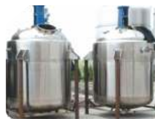
S.S. 304 REACTOR