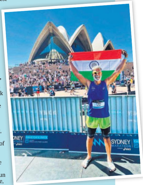
Milind Soman at the Sydney Marathon

"Have fun, do not be too hard on yourself and learn from your experience of preparation for the challenge every day," Soman wraps up, with a piece of advice for aspiring runners.