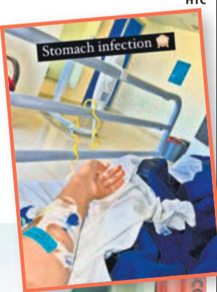
Jasmin Bhasin; (inset) her Insta Story

Meanwhile, actor Jasmin Bhasin was also admitted in a hospital due to stomach infection. The actor posted on Instagram Stories a picture from the hospital, resting on a bed. She wrote alongside the picture, "Stomach infection".