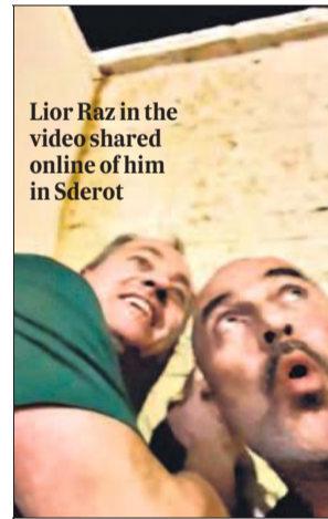
Lior Raz in the video shared online of him in Sderot

Israeli artist Lior Raz has stepped up to safeguard the people of his country amid the war situation in